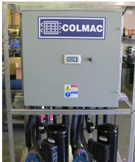
Colmac Water Source Heat Pump with PLC Control installed at Kukui'Ula Clubhouse on Kauai