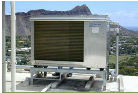
Colmac Air Source Heat Pump in Waikiki

The Waikiki Banyan, Kukui Plaza, Plaza at Moanalua, Kam Middle School, University of Hawaii, U.S. Navy, Nuuanu Park Place and Park Shore are just a few of the recent Colmac jobs awarded. Visit our Colmac Booth at this years PCEA Conference in Waikoloa or call to set up an appointment to meet with a Colmac engineer in September.