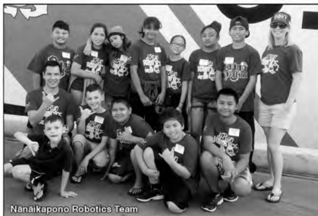
Nānāikapono Robotics Team